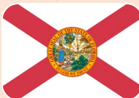
Florida Legislative Updates