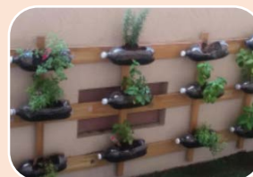
Site Visits from the Collab Office