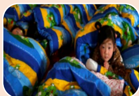
Issues and Equality Race