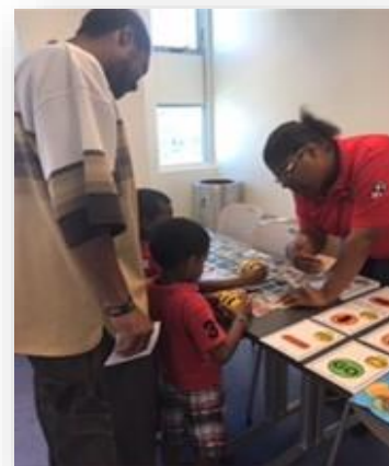
Introducing Bee Bots to dads and preschoolers at CAHSD Head Start in Miami, Florida.

https://www.naeyc.org/sites/default/files/globally-shared/downloads/PDFs/resources/topics/PS_technology_WEB.pdf