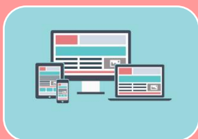
New HSSCO and FHSA Websites