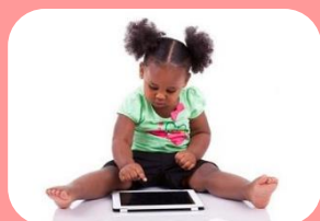
Technology and Interactive Media in ECE Programs