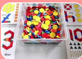
OEL Introduces New Florida Standards