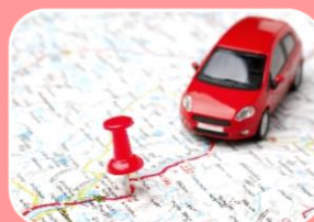
Site Visits from the Collab Office